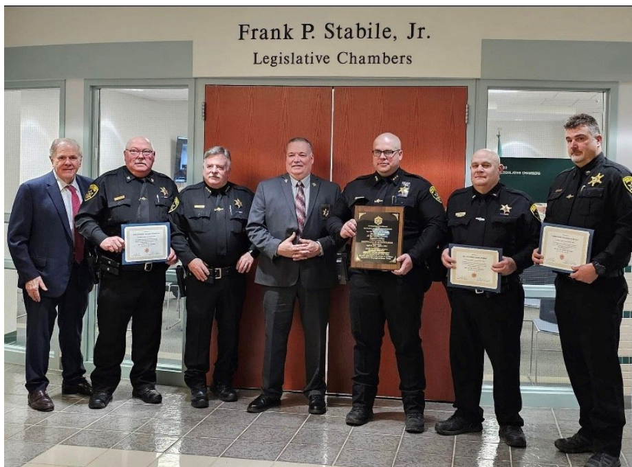
Jail Accreditation presented NYS Sheriff's Institute April, 2024