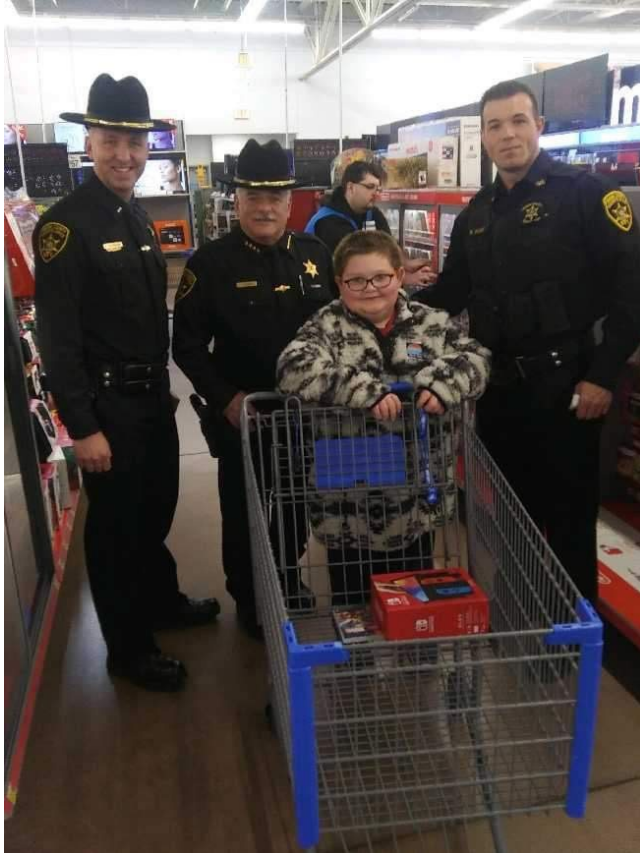
Shop With A Cop – December, 2024