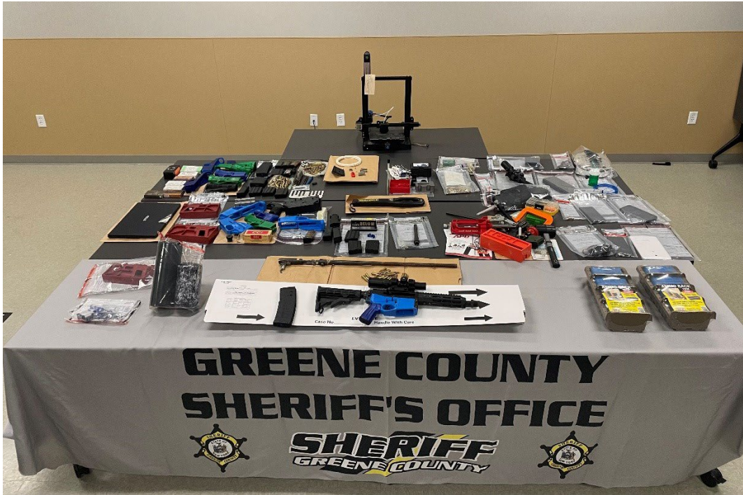
Seizure from search warrant Cairo, NY March, 2024