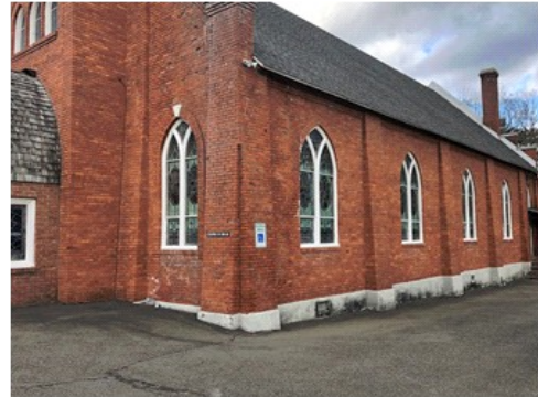
Sacred Heart Church – Palenville