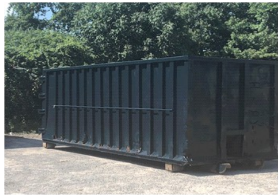
County Transfer Station – Catskill