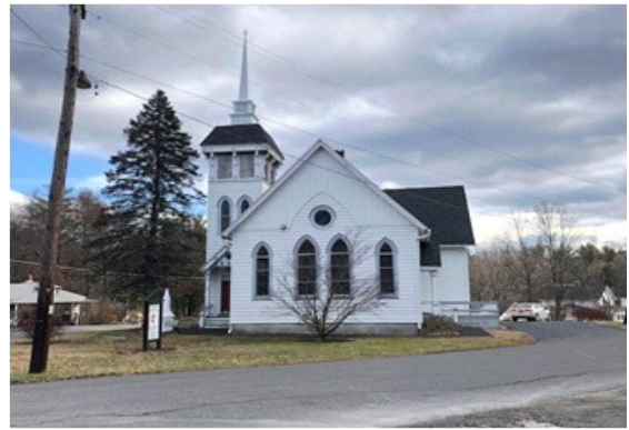
United Methodist Church – Palenville