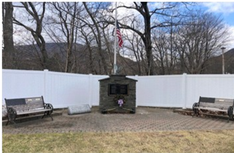
Veteran's Memorial - Palenville