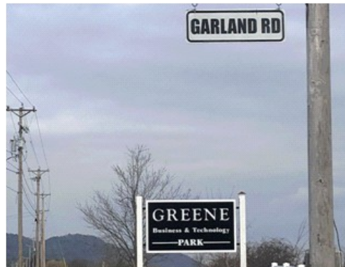
County Roads in Cocksackie