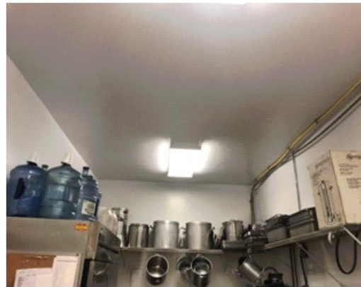
Kiskatom's Fire House