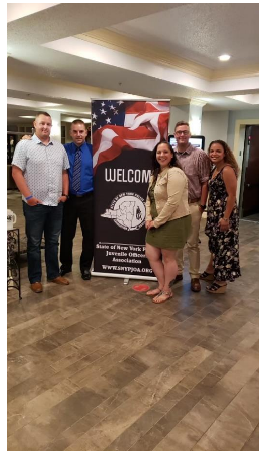
SROs at Training in Lake George, NY