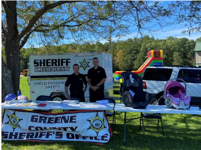
Deputy McMahon & Deputy Espel doing car seat checks