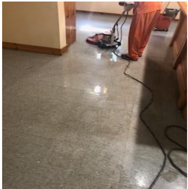
Kiskatom Fire Department