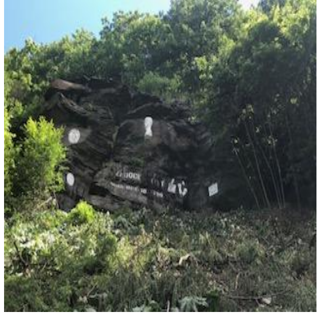
Prattsville Pratts Rock