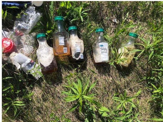
Coxsackie Industrial Park